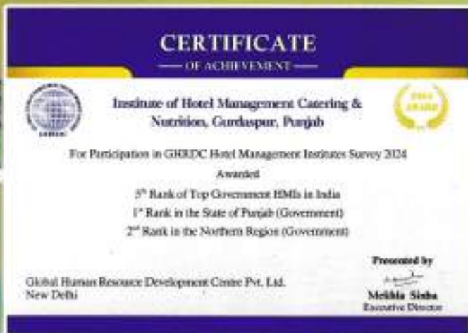
Another Feather in the cap