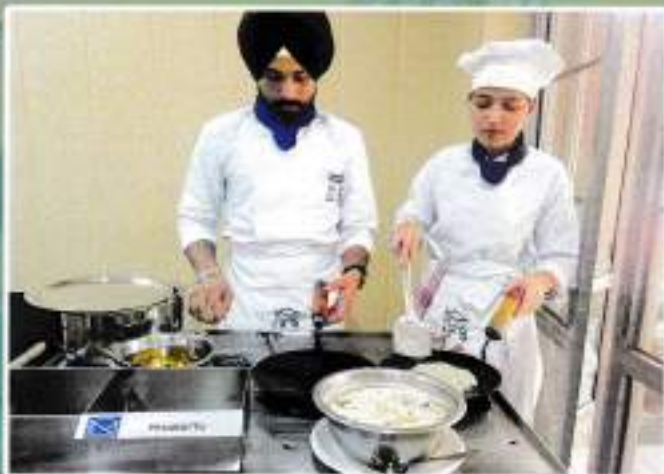
Andhra food live counter under EBSB