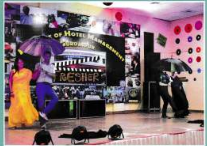
Welcome of the Fresher Batch