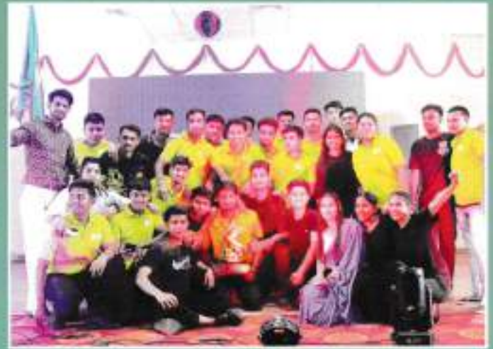
Winner House Rolling Trophy GAME 2024