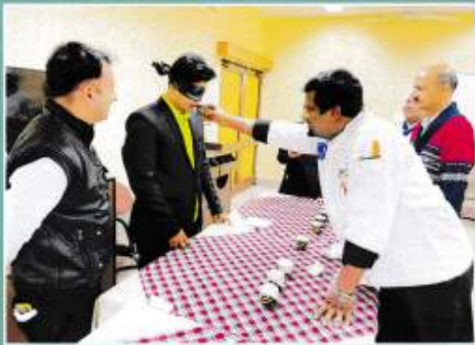
Ingredient Identification under Trade Competency Competitions