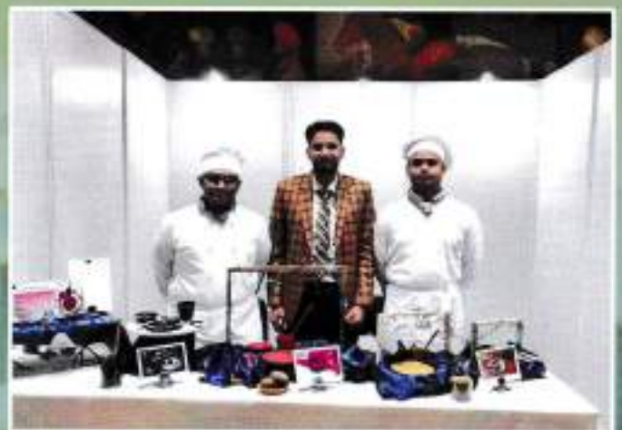
Design Challenge - 6th position in Edible Cutley Competition at NCHMCT, MoT