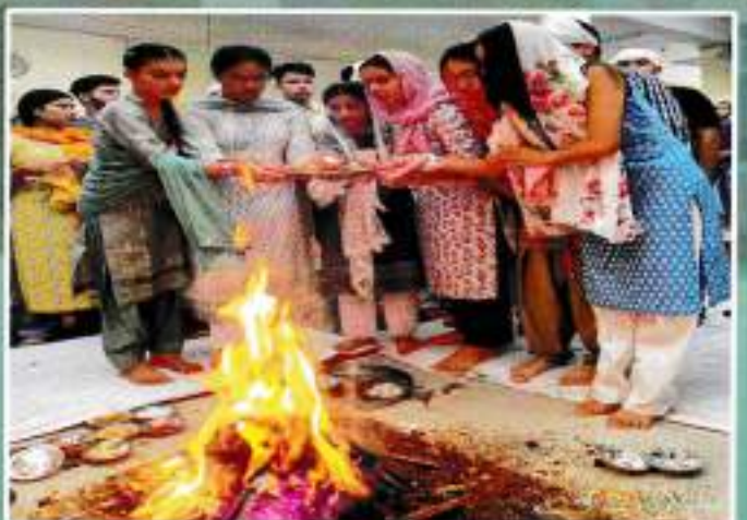
Auspicious beginning of the new academic session with Hawan