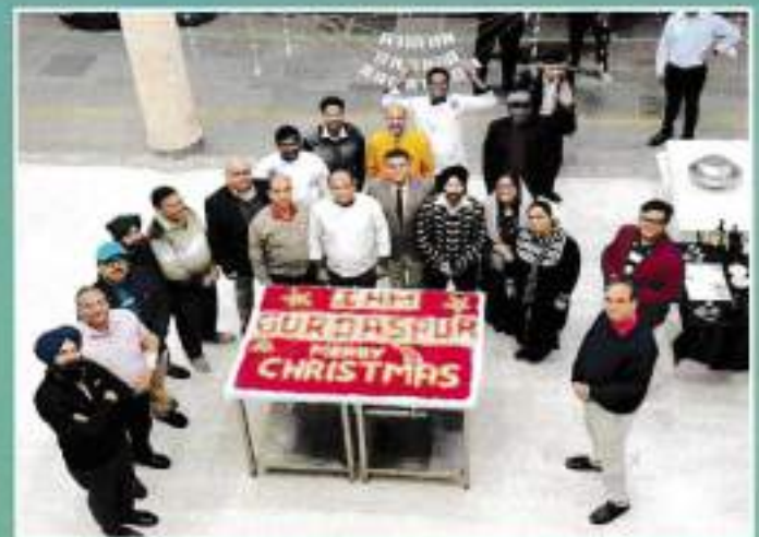
Cake-Mixing Ceremony in academic block