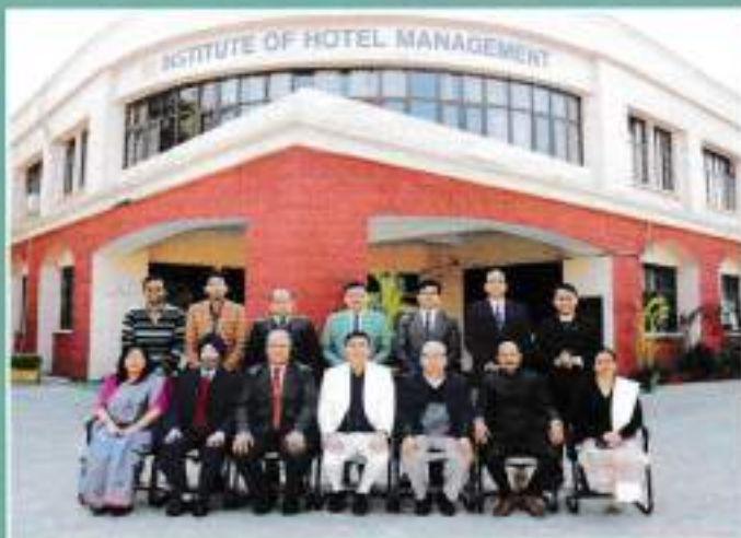
In-house Faculty Development Programme