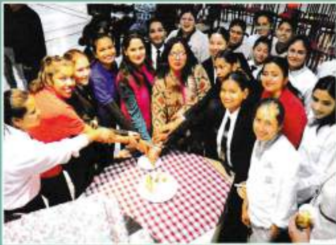
Women's Day Celebrations