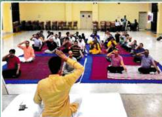
Yoga Session for Institute's Staff