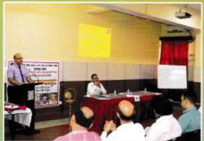
Hindi Pakhwada Udgathan Samaroh